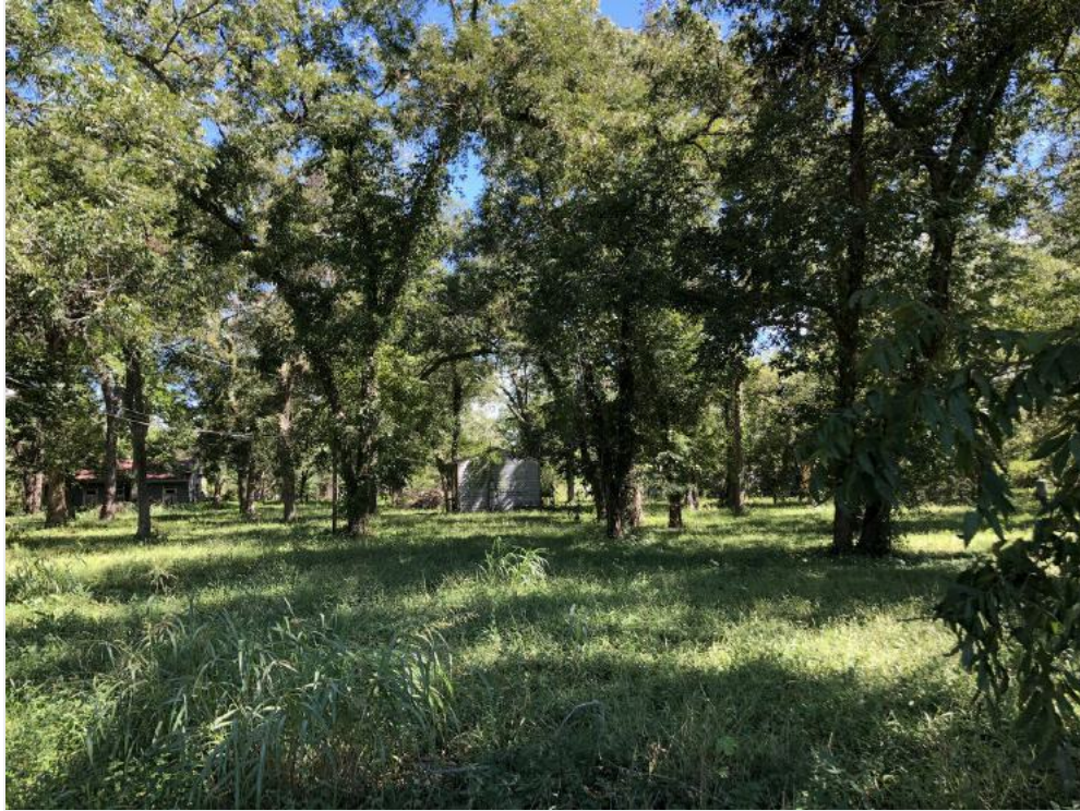
Interior View of Barns