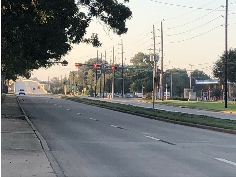
View of Frontage on F.M. 359