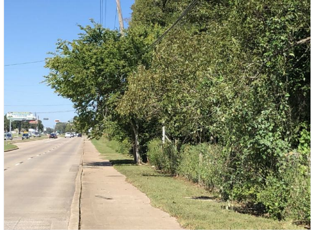
Subject frontage on F.M. 359