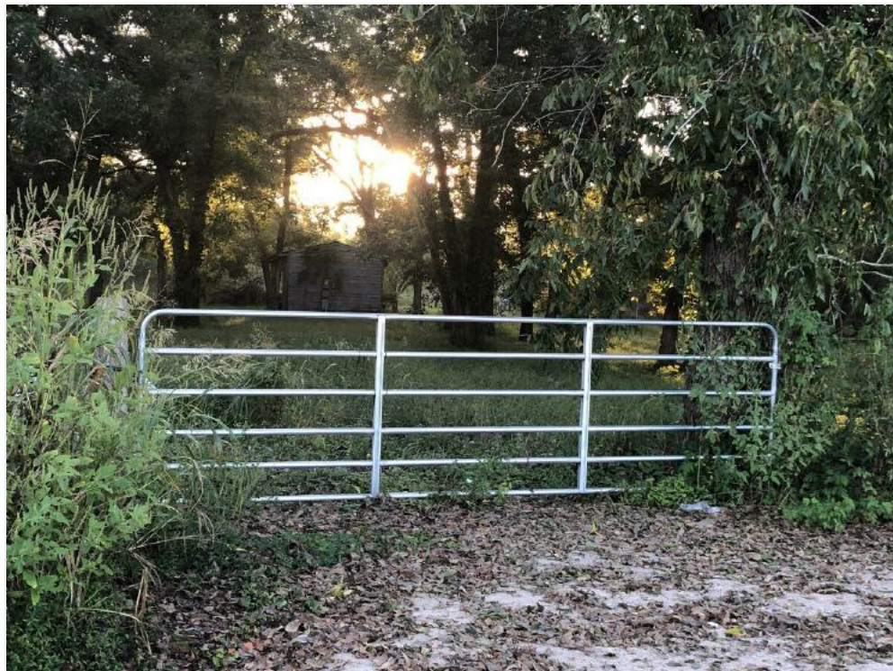
View of Entrance from F.M. 359